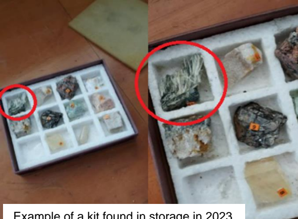
Example of a kit found in storage in 2023 that contains a sample of fibrous

The department has previously been alerted to the presence of asbestos rock samples contained in some imported 'mineral kits' purchased by schools. Processes, including product recalls, have been implemented to withdraw these from use.