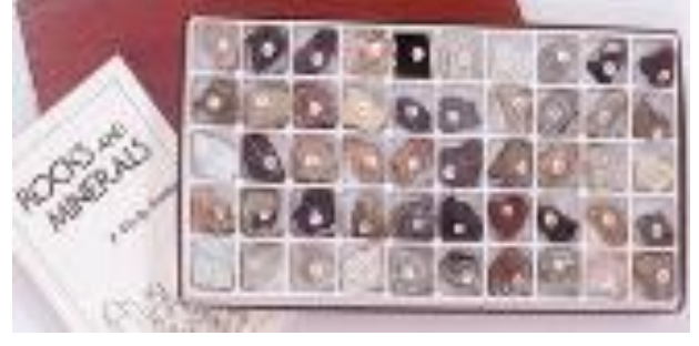
Example of a post-March 2011 kit found to contain a sample of serpentine.